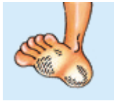
Corns and Calluses