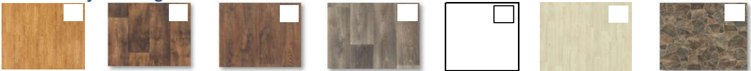
Maple (66) Vineyard Brown (61) Laurel Brown (62) Mountain Grey (63) Snow (89) White Wash (65) Rosemary Stone (64)